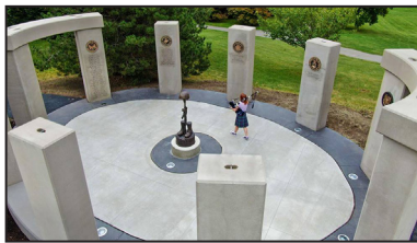
The Monroe County War on Terror Memorial was dedicated 11 September 2021 at Highland's Gary Beikirch Park.

The Council also supports other local organizations that we recognize as deserving, useful and whose objectives are parallel to our own. These include the Veterans Outreach Center , The Mark Callanan Memorial 5k Run , The Memorial Day Challenge , The Jason Dunham Memorial Golf Tournament and The Monroe County War on Terror Memorial .